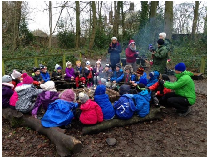
Toasting marsh melloes at Cliffe House Shepley Kirklees