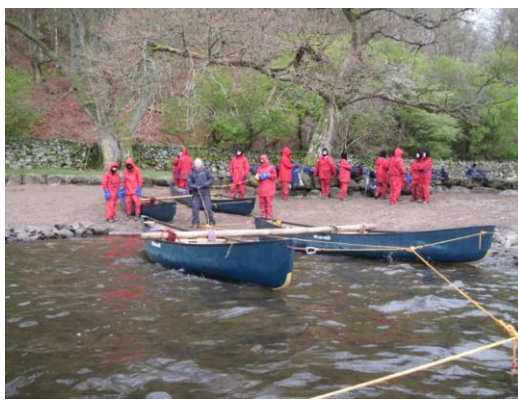
The shore of Ullswater out from Howtown, OBMS

You can add more than one provider in case you are using multiple providers in one day and you can also add accommodation separately from a provider.