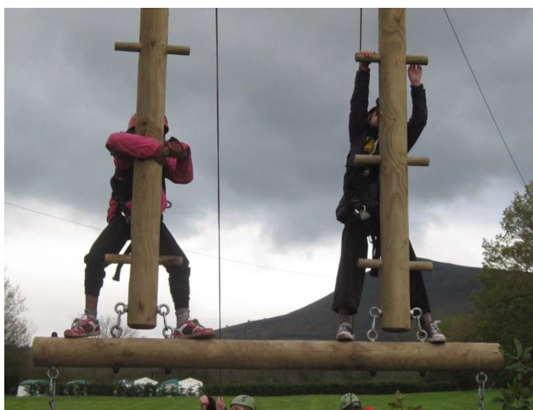
Acorn Adventure Brecon Beacons

Qualifications should be recorded in the Awards section of staff profiles on EVOLVE along with any statements of competence from technical experts.