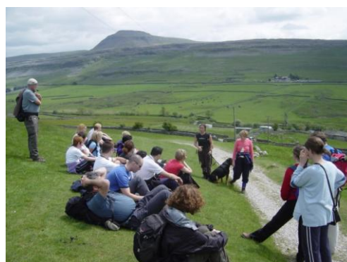
Field studies, Ingleborough