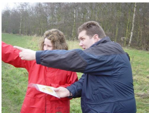
Orienteering at Oakwell Hall

Visit Leader training is available throughout the year and it is recommended that all visit leaders attend the training at least once.