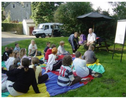
Outside Ingleton Youth Hostel

ALL THE ABOVE CAN ADDITIONALLY BE RECORDED ON EVOLVE IN A 'NOTE'.